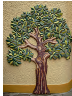
Mosaic relief "Oak Tree"

The artist sees the mosaic reliefs of different trees from all over the world as representing the deep spiritual significance they have had from time memorial. They will adorn the front as well as the internal space of the tunnel.