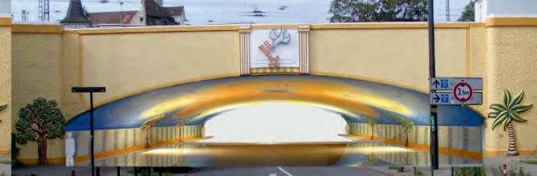
Model, "Tunnel of Peace", front side "Parkallee"