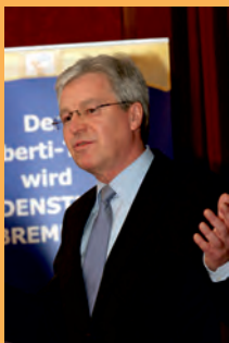
J. Böhrnsen, Mayor of Bremen

We give thanks to Bremen Town Hall and all our sponsors! Through our combined efforts we will create a building that is unique nationwide.