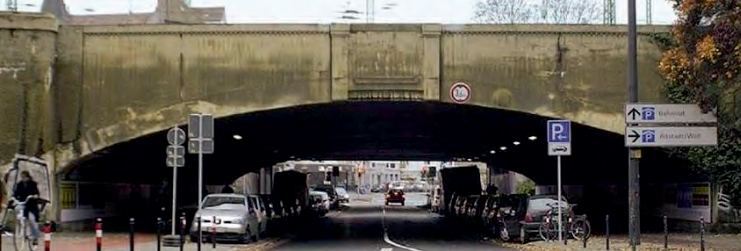
Rembertitunnel: Before transformation