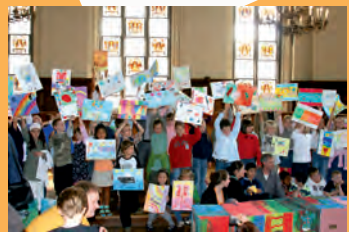
Project "Peace starts out small", Kids present their visual solutions in the Town Hall of Bremen