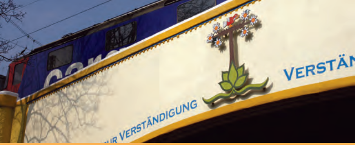
"Tunnel of Peace", part of the front side "An der Weide"