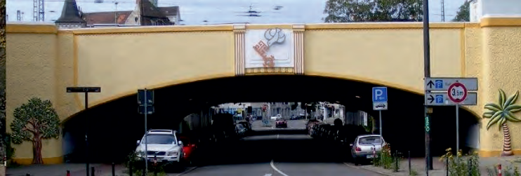
After transformation: "Tunnel of Peace"